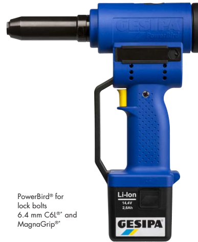
PowerBird® for lockbolts 6.4 mm C6L®* and MagnaGrip®*

Nosepiece in working position Li-Ion power battery 2,6 Ah/14,4 V with charger Operating instructions with spare parts list plastic carrying case