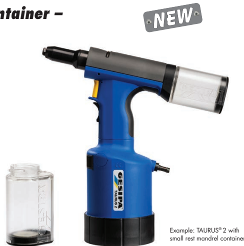
Example: TAURUS® 2 with small rest mandrel container

Advice, prices and delivery time on request.